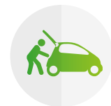
FITS IN A SMALL CAR