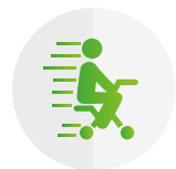
TO BE SEATED