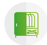
STORE IN ANY CLOSED