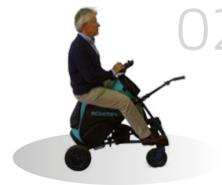
If you are a little tired