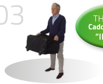
Light and easily folded by your own