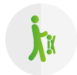
FOLDED ON YOUR OWN