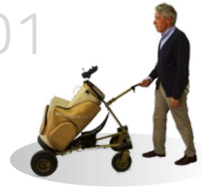
If you prefer to walk